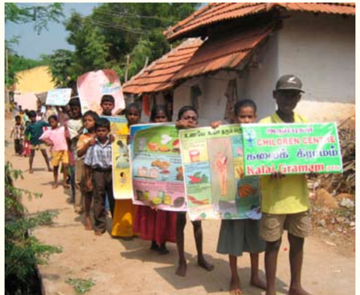
Sanitation Education Program at the Center for Culture and Development, Madurai, India.

USA – Clear Path International (Pakistan), SD USA