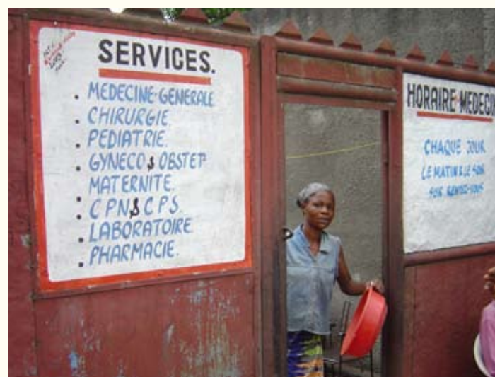
Yenge Maternal Health Clinic in Kinshasa, D.R. Congo.

A primary function of the SD Network Office is to facilitate communications between members of the network, and inform the wider Subud community and the public of our activities. We distribute information through Subud Voice and Subud World News , ISC and WSC listservers, national Subud and SD newsletters and listservers, the SDIA website, the Network eNews and SD members' listservers. Over the last few years, the number of printed publications have fallen substantially as we, and the world, have grown to rely more the internet and electronic media. SDIA considers that for ecological reasons, it important to conserve resources and print documents only when necessary. In Bangalore we received feedback from SD members and Subud members not so familiar with the work of SDIA, that our communications must improve in both the collection and presentation of information about the network activities. This we will endeavour to do in the year ahead.