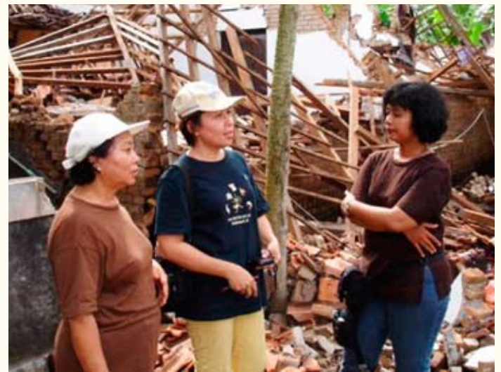
Members of the SD Indonesia team assess the damage from the Jogjakarta earthquake.

The Annual General Meeting, held in Bangalore, was well attended by Board members, SD Nationals, project leaders and the International Helpers. This was a wide ranging meeting in which we were able jointly to explore how members saw the need for the Board and Executive to increase the value they can add. During the meeting the Board was explicit in its belief in a need to expand and deepen the active relationship between itself, the National SDs, projects and members. This was a recurrent theme during the four day meeting. For