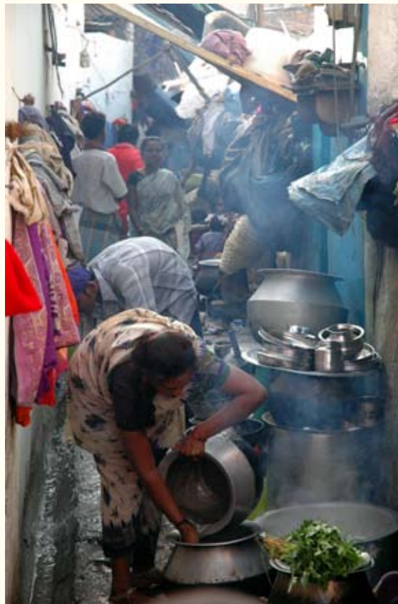
Railway community in Bangalore India, location of the Anisha Project.